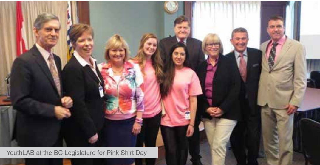
YouthLAB at the BC Legislature for Pink Shirt Day