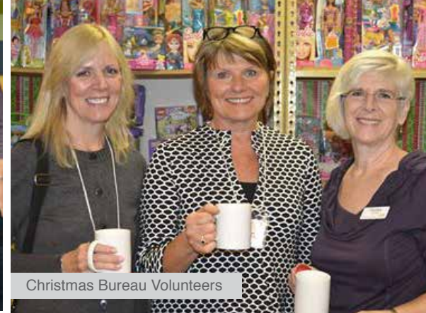
Christmas Bureau Volunteers