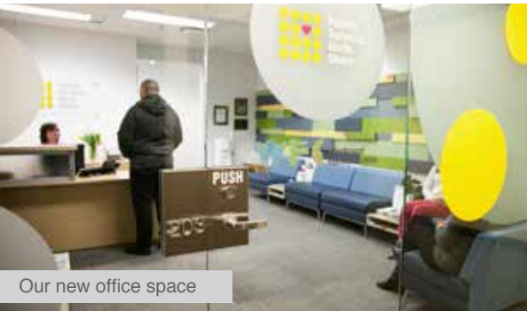
Our new office space