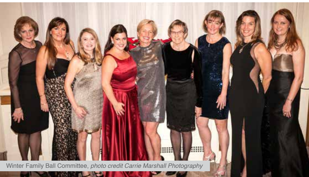
Winter Family Ball Committee