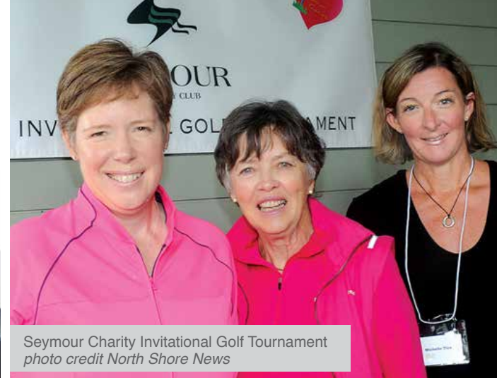
Seymour Charity Invitational Golf Tournament