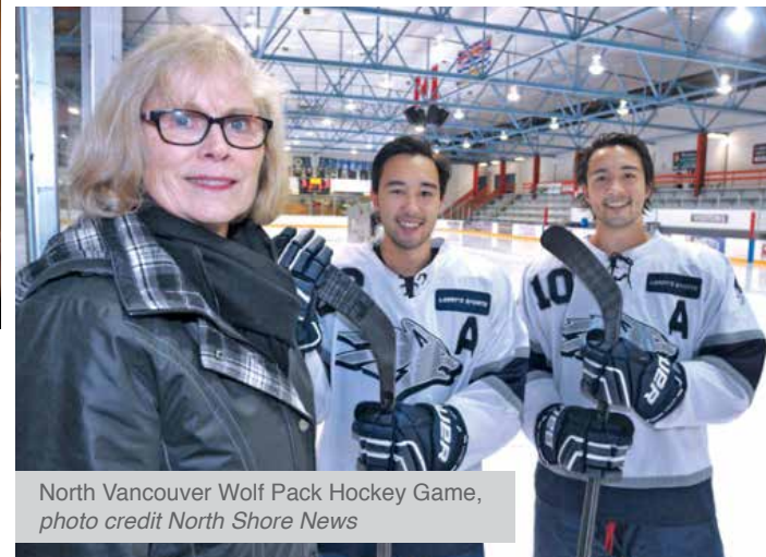
North Vancouver Wolf Pack Hockey Game