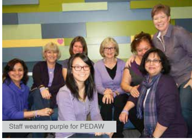
Staff wearing purple for PEDAW