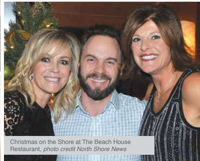
Christmas on the Shore at The Beach House Restaurant