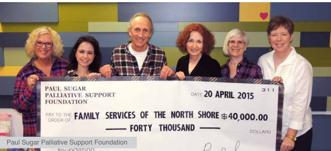
Paul Sugar Palliative Support Foundation foundation