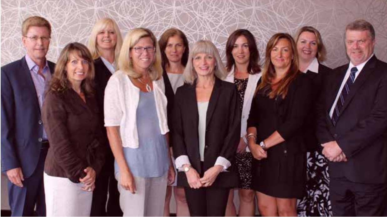
Our 2014/2015 Board of Directors