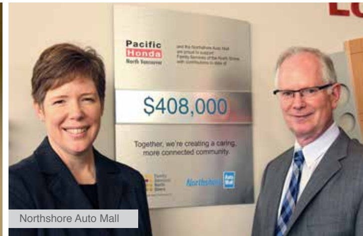
Northshore Auto Mall